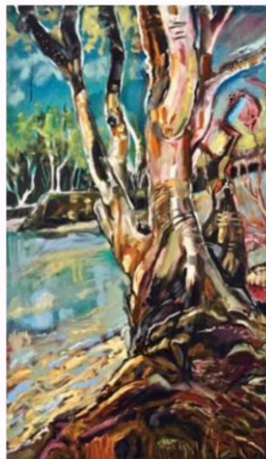
'River gum at Wentworth' Oil on canvas 1520x910mm